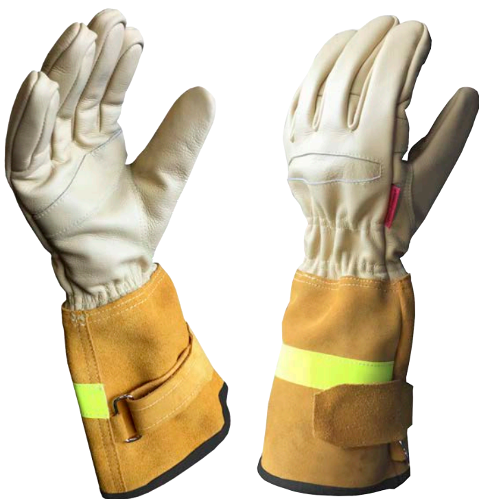
Separate thumb slit