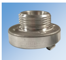
W2045 Storz x Male Thread