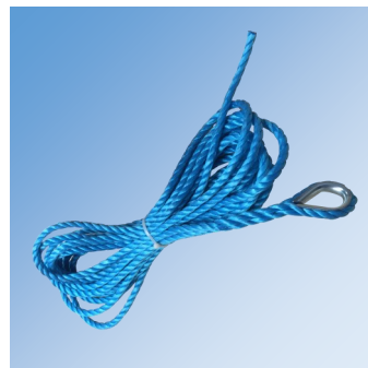
W651091-4 10m Retrieval cord